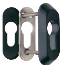
Detalle del escudo E210