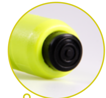
Rubber covered Switch

The 2AAA eLED PEN I-ETB works reliably even in extreme conditions, which makes it a valued tool by construction workers, workers in utility companies, maintenance teams, etc..