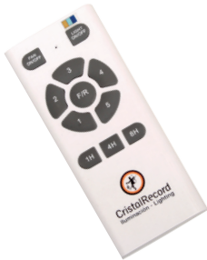
85-459-22-281 Gris – acero Steel grey – Gris acier